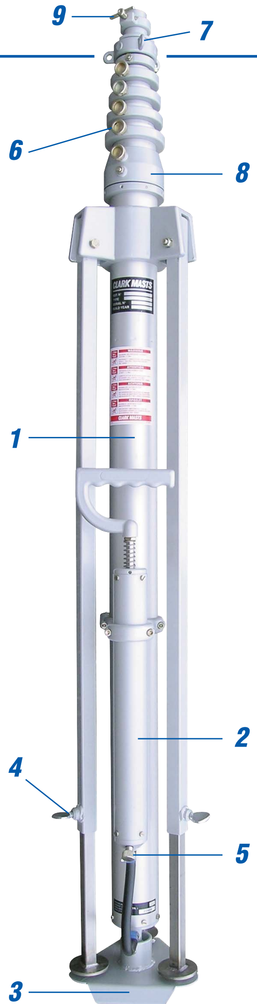
PHOTO SHOWS CSFT-R6-6/HP MAST