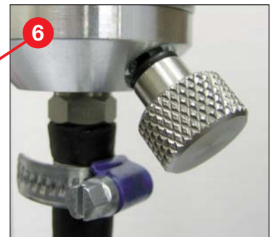
Air release screw