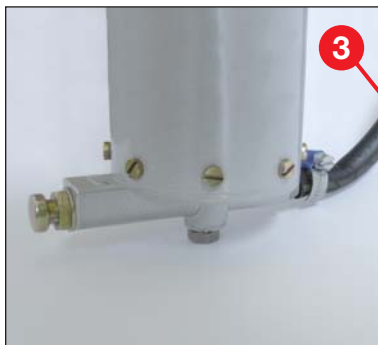
Bottom stud for quick and easy fitting onto a tripod