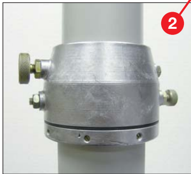
Lockable mast rotation collar, standard natural clear anodised seamless drawn aluminium mast sections with Ø 3" (76,2 mm) base tube