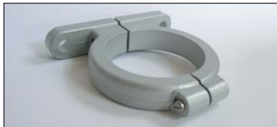
Wall Mounting Bracket