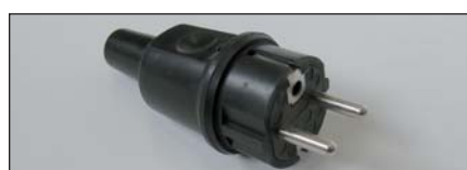
Schuko type with extra earth pin connection and rubber body