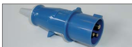
Type CEE17 Colour : blue

Plugs recommended for 230 volt installation