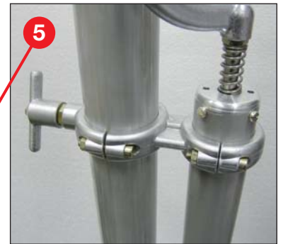
Handpump with top stud for quick and easy fitting onto a tripod