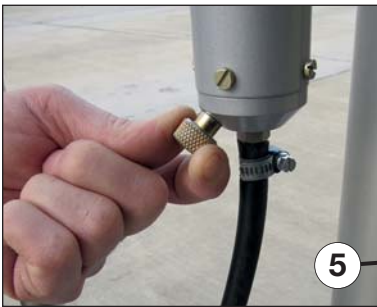
5 Air release screw on the bottom of the handpump.