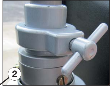
2 Quick clamp socket Ø 24 mm for attachment of the lamp units onto the mast with lockable tommy screws.