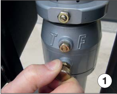
1 Lockable mast rotation collar for 360° turning of the mast and lamps in the desired direction.