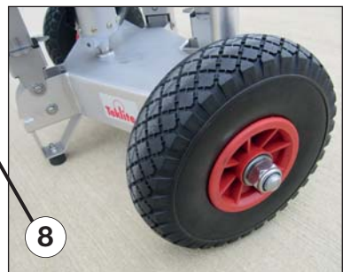
8 Polyurethane wheels, airless and with needle roller bearing.