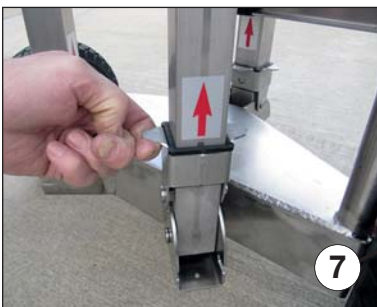
7 Trolley legs completely in stainless steel with super fast "Click" locking system.