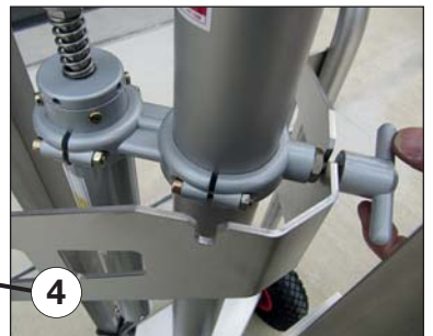
4 Standard natural clear anodised aluminium telescopic mast with tee handle for quick and easy clamping onto the RLU-FHT trolley.