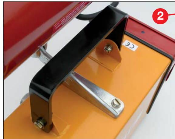
Rigid carrying handle.