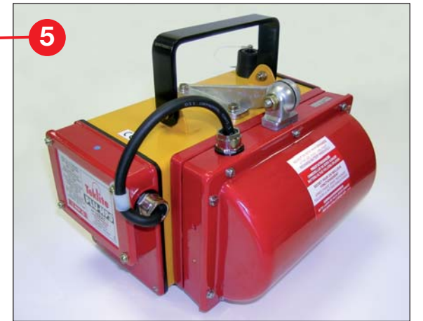
Lamp in closed position gives protection against accidental damage.