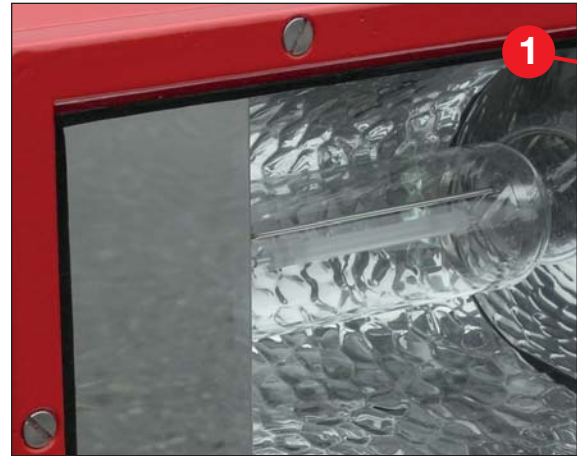
70 Watt, 12 Volt HPS (High Pressure Sodium) bulb. Lamp protection : IP65