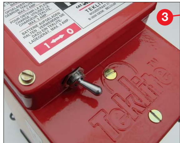
Built-in circuit board with integrated ON/OFF switch.