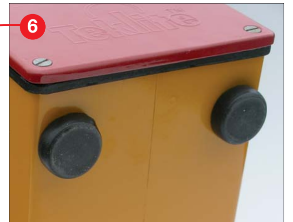
Strong rubber caps for good stability.