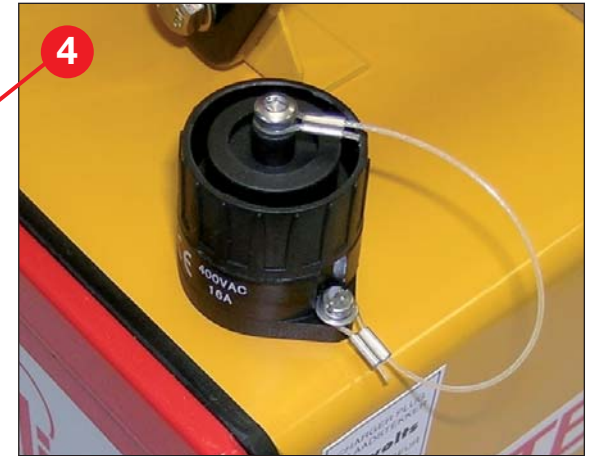
Binder socket to plug in the Teklite charger to charge the 12 volt 12 Ah battery. Finish : Yellow RAL 1007 Red RAL 3000